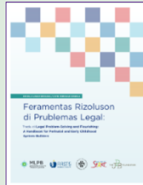
Cape Verdean Creole